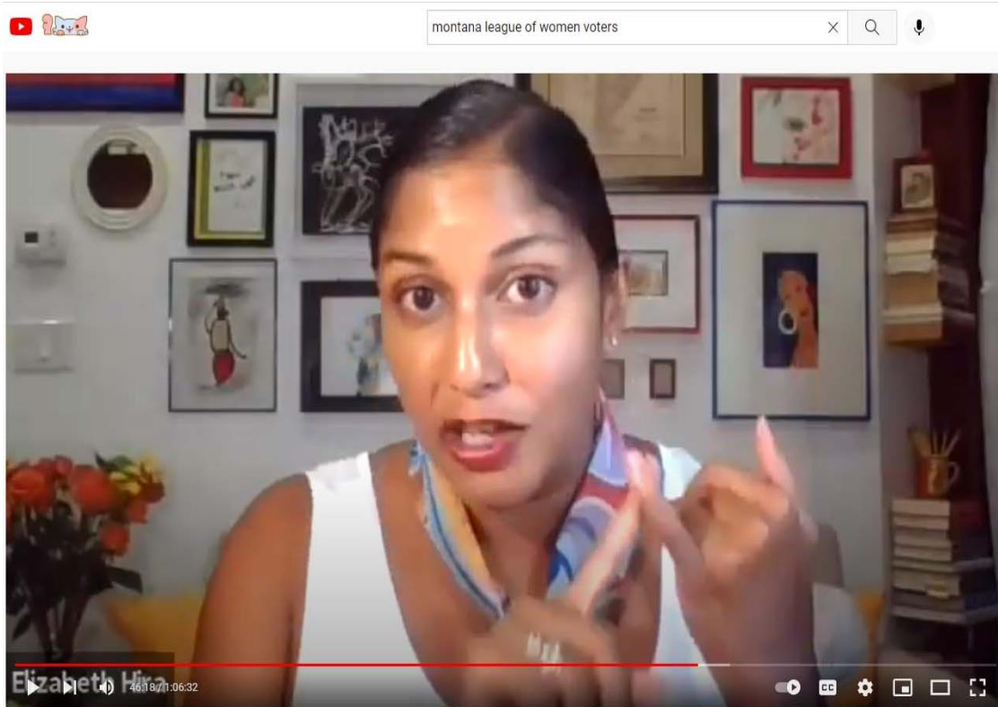
Freedom to Vote Act