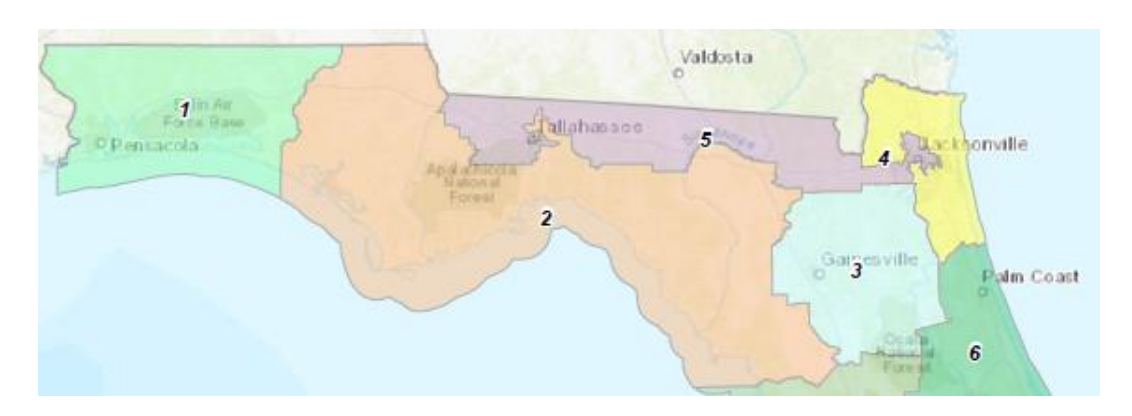
The Benchmark Plan (App. (Vol. VI) 696):

Governor DeSantis vetoed the Legislature's plan on March 29 and called a special legislative session. App. (Vol. VI) 635-37, 643-46. The Governor released his own congressional plan on April 13 that eliminated any district resembling either the Benchmark Plan's or any of the Legislature's proposed configurations of CD-5: