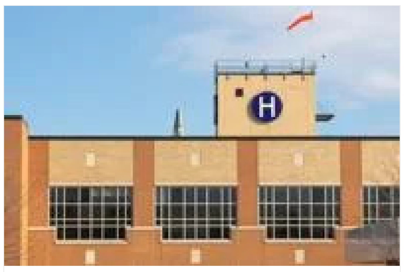
Mount Nittany Health receives quality achievement award from American Heart of Association