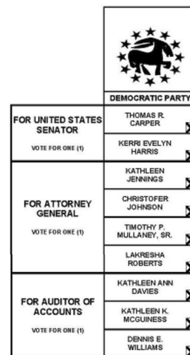
Sussex County, DE 2018 Democratic primary